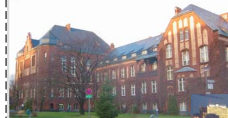
„Alte Nervenklinik“ Charité, Berlin