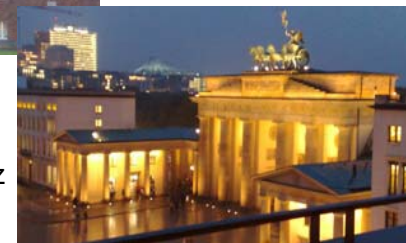
Brandenburg Gate and Potsdamer Platz at night, Berlin